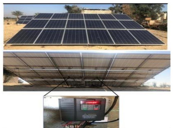
Fig. 3. Solar energy water pumping system