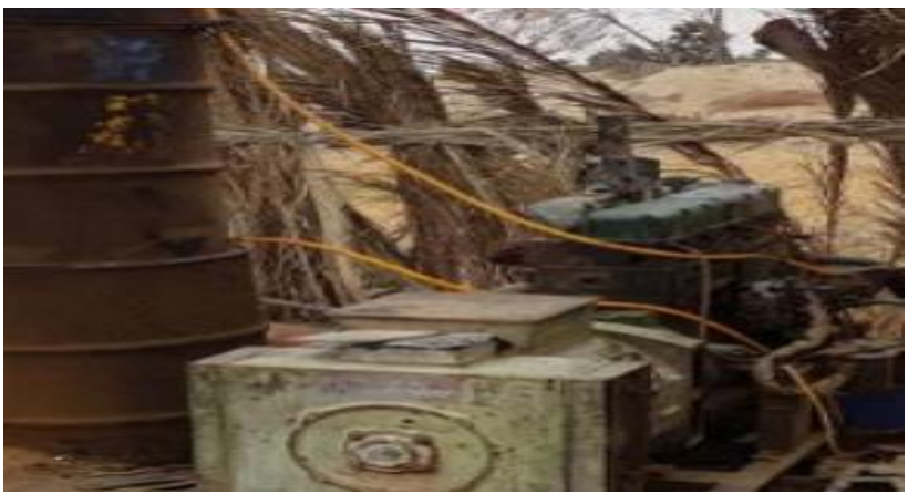
Fig. 1. Diesel energy water pumping system

addition to the drive of the water pump is done by the pump controller. Figs 2 and 3 illustrate the main components of the PV water pumping system as a schematic diagram as well as the solar panels and the transformer system in the studied farm. Solar panels were collected of smaller solar cells which are predominantly made using crystalline silicon (more mature technology), where increasing module temperature will reduce power output from the panel In this type of panel). The cell possessed a very dark blue almost black appearance as well as no perceivable cell division lines. The individual solar cell was a 6" x 6" square, where 60-cell panels were laid out in a 6 \times 10 grid.