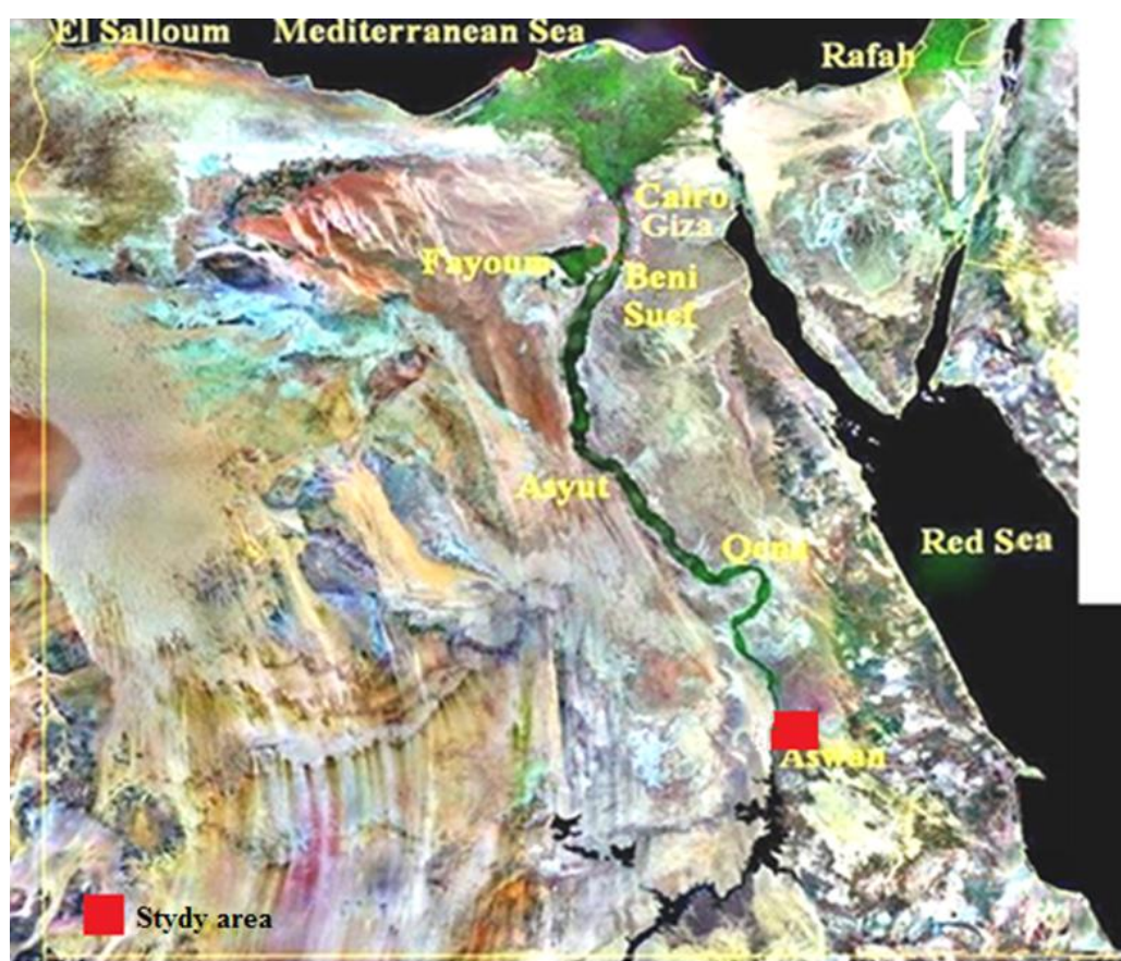
Figure 1. Location map of the study area